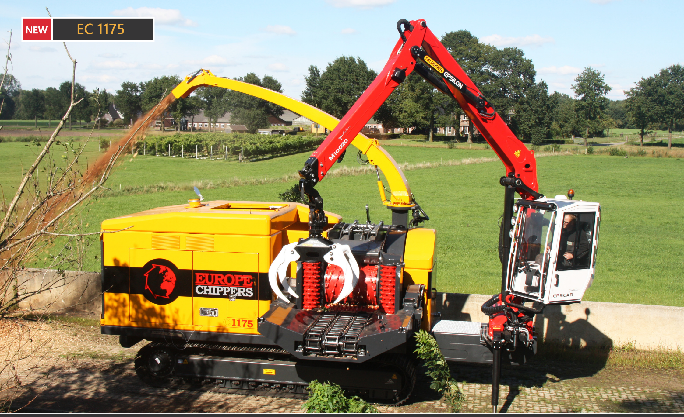
UP TO 200 M3/H. UP TO 750 HP. UP TO 600 MM LOGS.