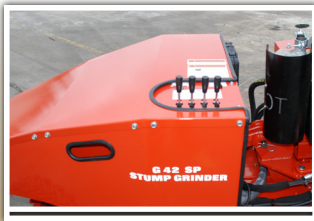
FINGERTIP CONTROLS Easily maneuver unit with comfort grip controls