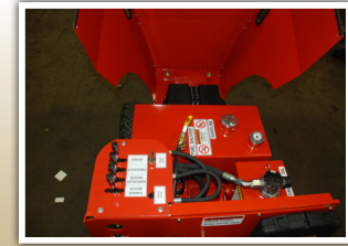
ALL STEEL CONSTRUCTION Steel where steel matters most