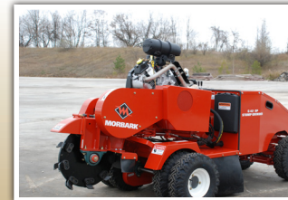
BOOM PIVOT ASSEMBLY Enhanced design in critical areas for extended service life